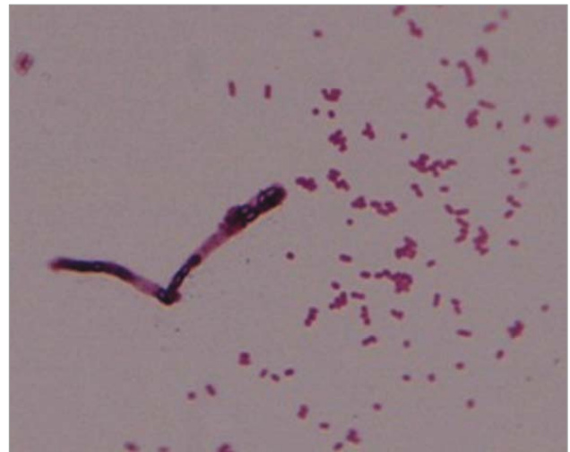
Bacterial cells with x100 objective, using immersion oil