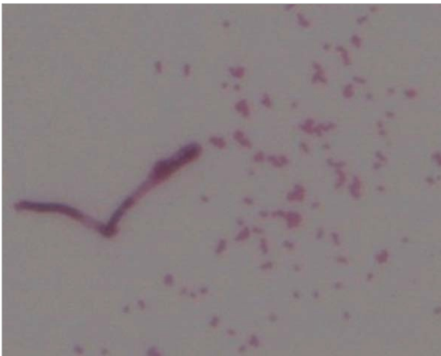
Bacterial cells with x100 objective, and no immersion oil

An image appearing sharp using the x40 objective will be indistinct if the x100 objective is swung into place, because the amount of light transmitted through the specimen into the lens is too small for accurate focusing. Filling the space between the slide and the lens with immersion oil allows the x100 objective to capture more light, and dramatically improves the resolution.