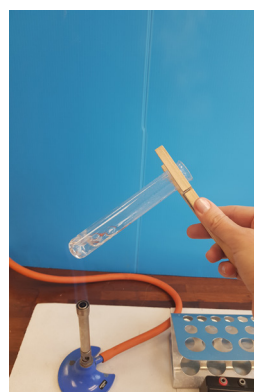
Fig.2 Keep the test tube at an angle.